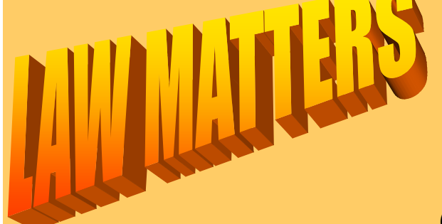
Law Matters returns to the airwaves in February 2013