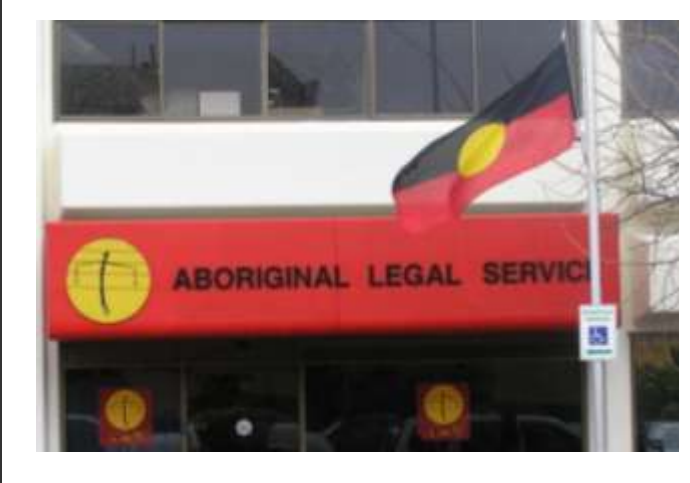
The Aboriginal flag at ALSWA Head Office flies at half mast following the passing of Terry...